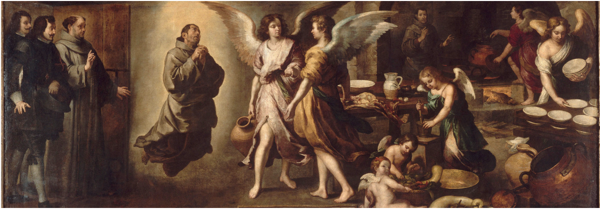
Figure 3. Bartolomé Esteban Murillo La cocina de los ángeles (The Angels Cooking) Oil on canvas, 1646 Musée du Louvre, MI203